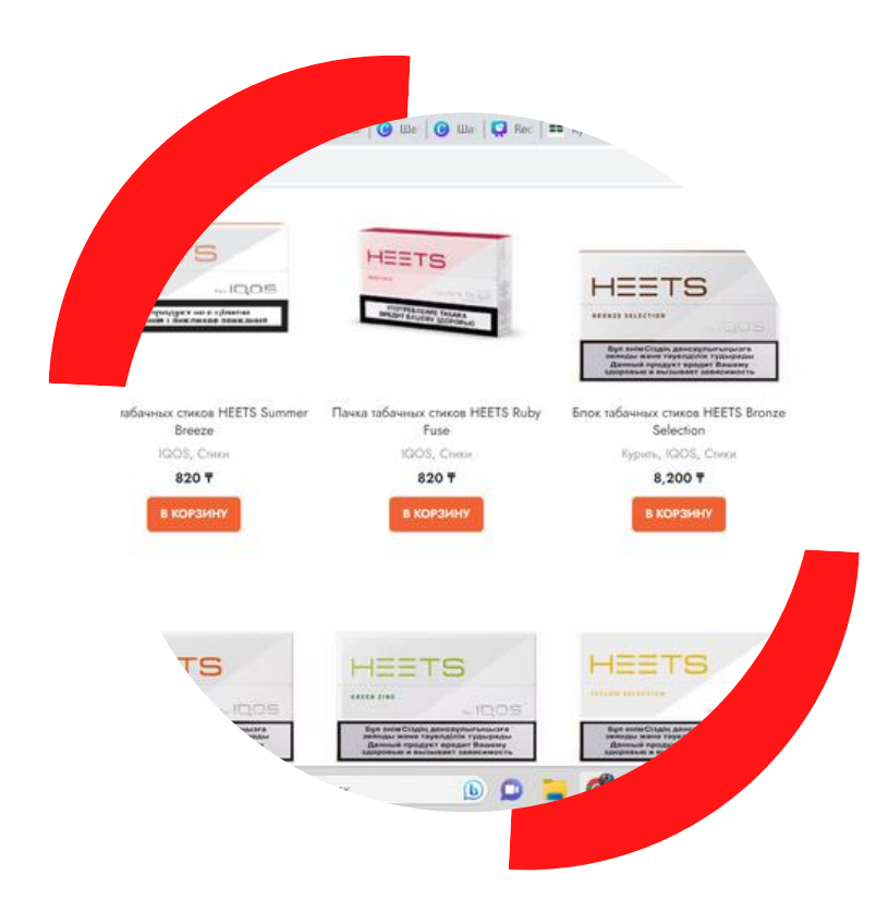
38-45 tenge per stick