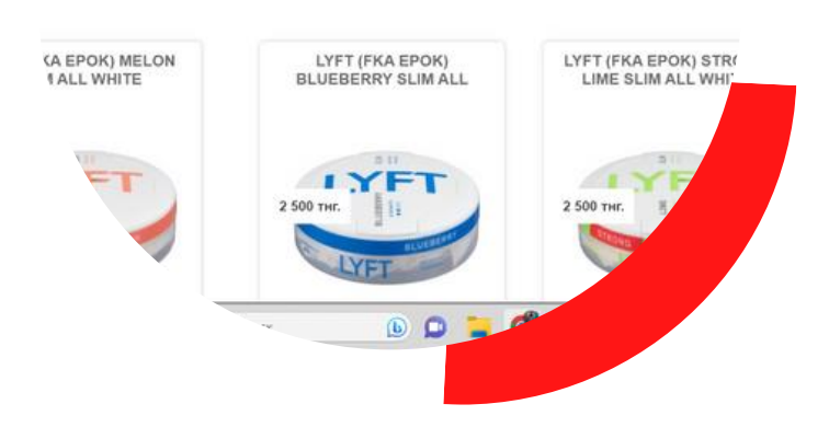
145 tenge per portion