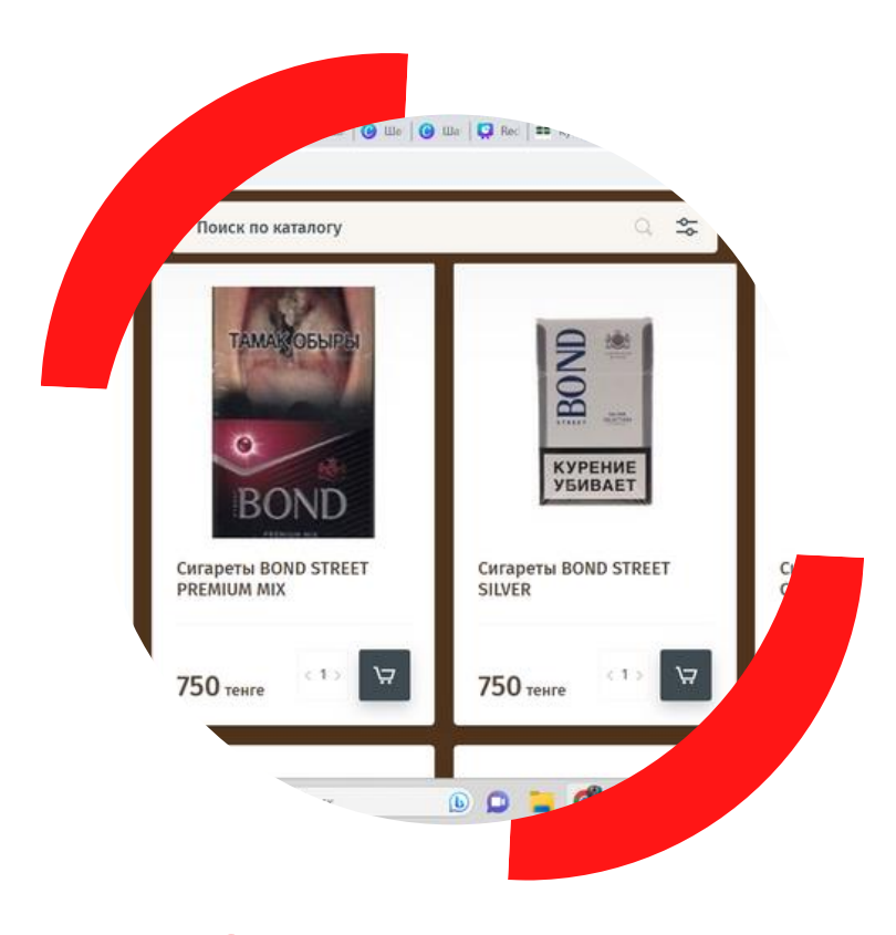
37 - 45 tenge per cigarette